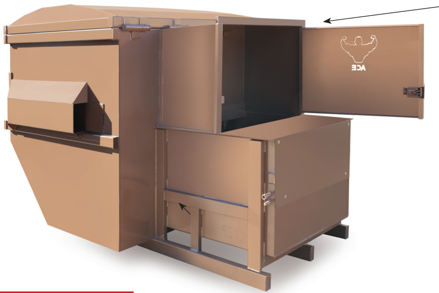
Optional Doghouse with Door