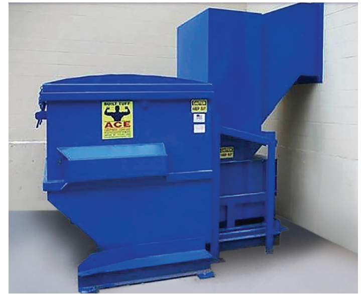
Above Shown with Optional Chute